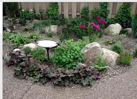
Rain garden in a small backyard that collects runoff from roof and patio.

http://www.bbg.org/gar2/topics/design/2004sp_raingardens.html .