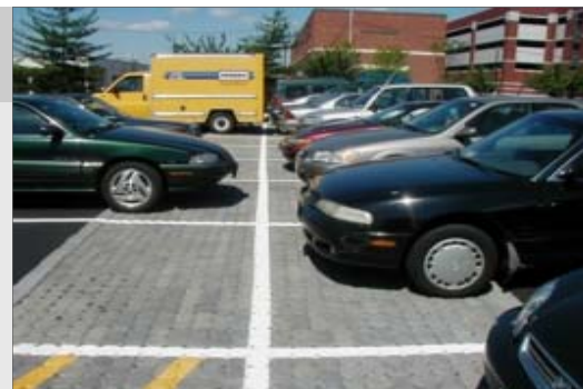
Porous pavement covers about 1/3 of each parking space in the D.C. Navy Yard parking

Retrofit a Parking Lot to increase permeability. Over sixty-five percent of impervious areas are associated with "habitat for cars". Using porous pavement in parking lots is a simple way to increase infiltration and reduce runoff. When the US Navy Yard in Washington, D.C. needed to repave its parking lot, they used porous pavers. They also added bioretention cells to the landscaped areas and disconnected downspouts. The re-design did not alter the amount of parking spots, but reduced peak runoff and pollution, thus protecting and helping to restore the Anacostia and Potomac Rivers and the Chesapeake Bay.