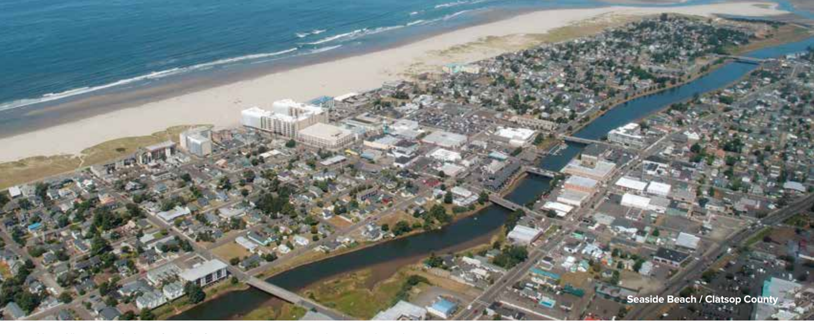
Note: All averages below refer to the five-year-average unless otherwise indicated.

Oregon's Department of Environmental Quality monitors water quality at ocean beaches between Memorial Day and Labor Day and tests for one fecal indicator bacteria, Enterococcus . This is in contrast to California, which requires three indicator bacteria to be tested from April 1 to October 31 every year. Funding for ocean beach monitoring in Oregon comes entirely from the U.S. Environmental Protection Agency's (EPA) Beaches Environmental Assessment and Coastal Health Act (BEACH Act).